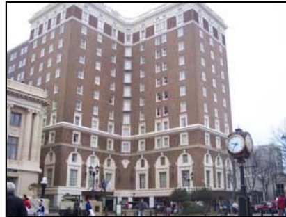
The Westin Poinsett Hotel is a Greenville landmark that is steeped in history.