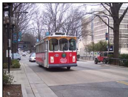
Greenville is making its downtown easy to get around with its own trolley system.

Sure there are tacky buildings from the 1960s and 70s, but the storefront brick facades and tree-lined streets drown out the drab exteriors to buildings like the structure that houses the town's newspaper.