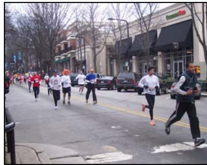
Runners in downtown Greenville, South Carolina

I admitted that this was no ordinary dining experience. This was Mary's at Falls Cottage. No, this delightful little cottage cum restaurant isn't in Savannah, Chattanooga or Raleigh. This Mary's is in Greenville, South Carolina.