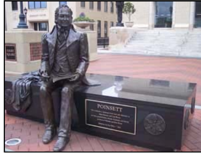
Joel Robert Poinsett

While serving as Minister to Mexico in 1825, Poinsett introduced to America a species of the Euphorbia pulcherrima plant later named Poinsettia in his honor. There is a statue of him next to the hotel on South Main Street.