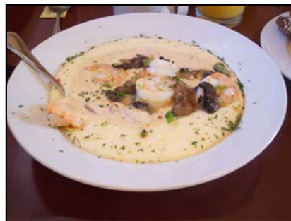
The Shrimp and Grits at Mary's Cottage in Greenville is a scrumptious treat for brunch.

All of that walking made us hungry. We checked into Soby's on South Main Street. I was thankful that we made reservations on this particular weekend evening. The crowds build around 6 p.m.