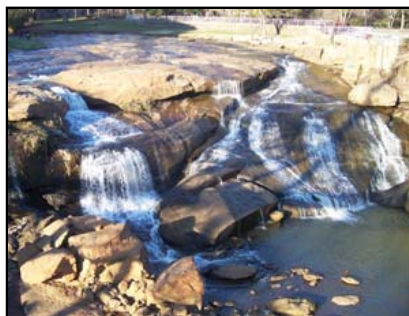
Reedy River Falls is a sight to behold with its grace and beauty.

The entrée selection offers an array of unique dishes including a Pan Roasted Grouper Filet with sweet potato puree and an outstanding Black Pepper and Espresso Rubbed Carved Venison Medallions.